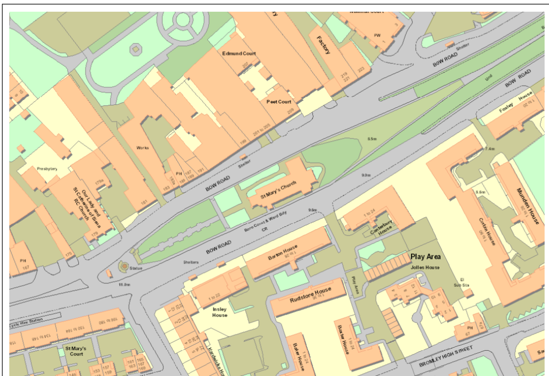
Location of St Mary and Holy Trinity Church